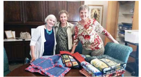
Prayers & Squares