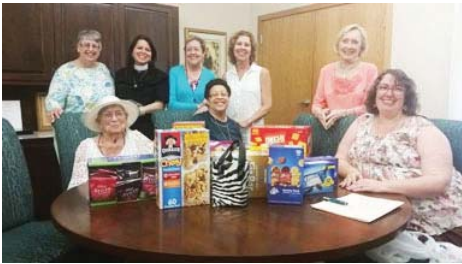
Daughters of the King