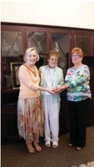
Lay Eucharistic Visitors