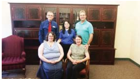
Walking the Mourners Path