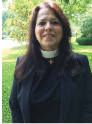
The Deacon in the Church

A deacon is one of three distinct orders of ordained ministers (bishops, priests, deacons) in the Episcopal Church. Within the Anglican Communion an individual becomes a deacon by being ordained by a bishop after having completed a course of study and formation. If I may add, a rather long course.