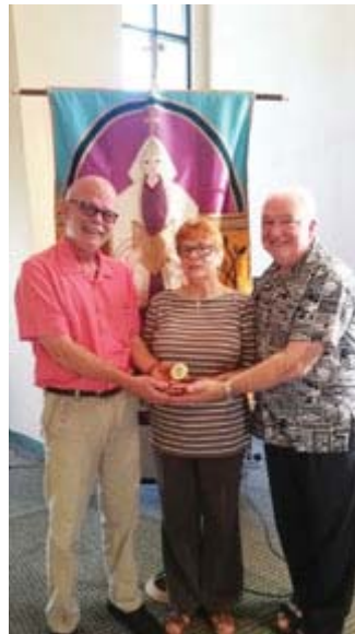
Flower Delivery Ministry